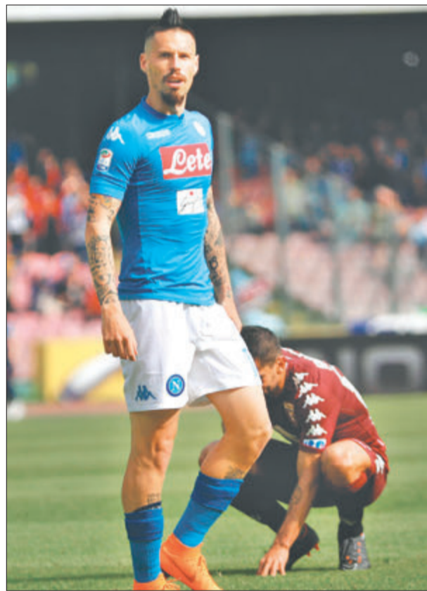
Napoli midfielder Marek Hamsik reacts after scoring a goal against Torino during their Italian Serie A match at the San Paolo Stadium in Naples on Sunday.