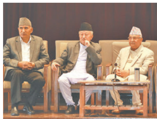
CPN-UML Chairman and Prime Minister KP Sharma Oli (right) seen with Subas Nembang (right) and Bishnu Poudel during the UML Parliamentary Party meeting in Kathmandu on Sunday.