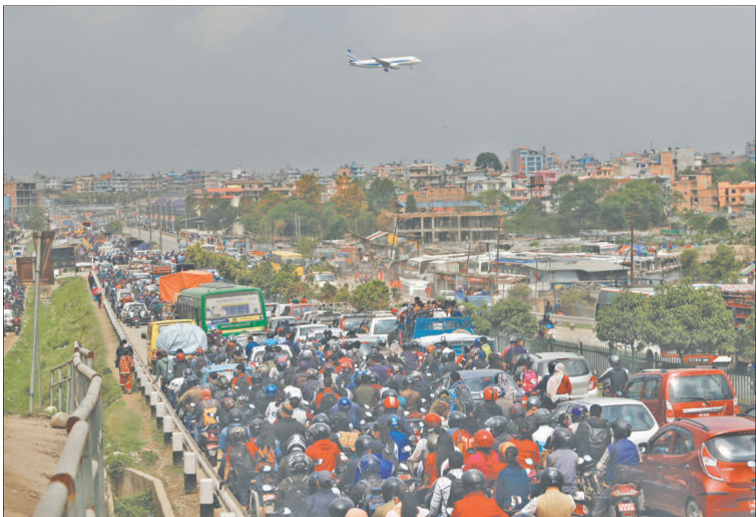
▲ A traffic jam at Lokanathi section of the Koteswar-Bhaktapur road on Sunday. Traffic officers say managing the congestion here can be stressful during rush hour. With the traffic lights long out of order, the vehicles have to be guided manually.