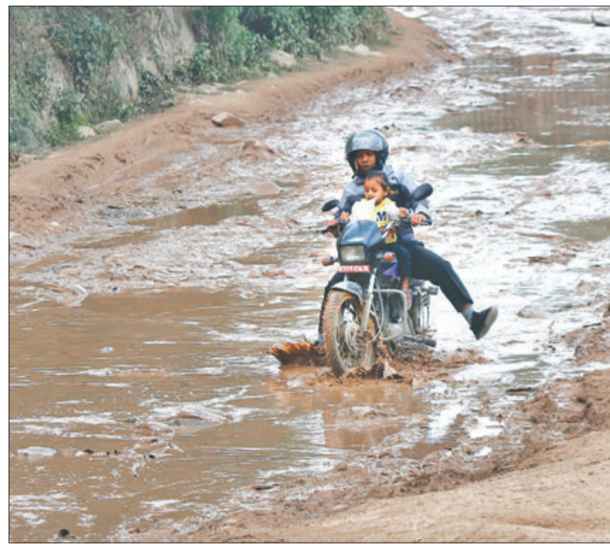
■ A man and his child negotiate their way through a muddy road on a motorcycle in Guheshwori, Kathmandu, on Sunday. People say this section of the Narayantar-Gaurighat Bagmati Corridor is wet and muddy throughout the year as water trucks ply this pothole-ridden road frequently, spilling water off their tankers.