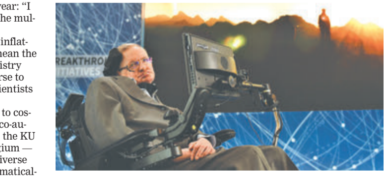
A file photo shows renowned cosmologist Professor Stephen Hawking at a press conference at One World Observatory in New York.