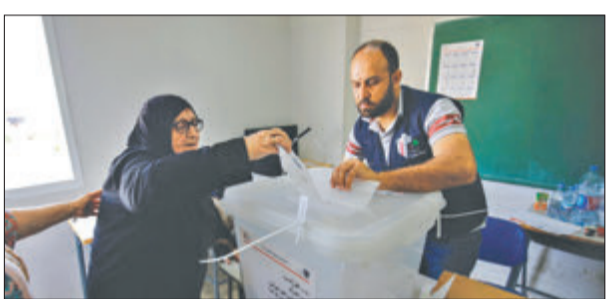
An elderly Lebanese woman casts her ballot during the first parliamentary election in nine years, in the northern port city of Tripoli on Sunday.