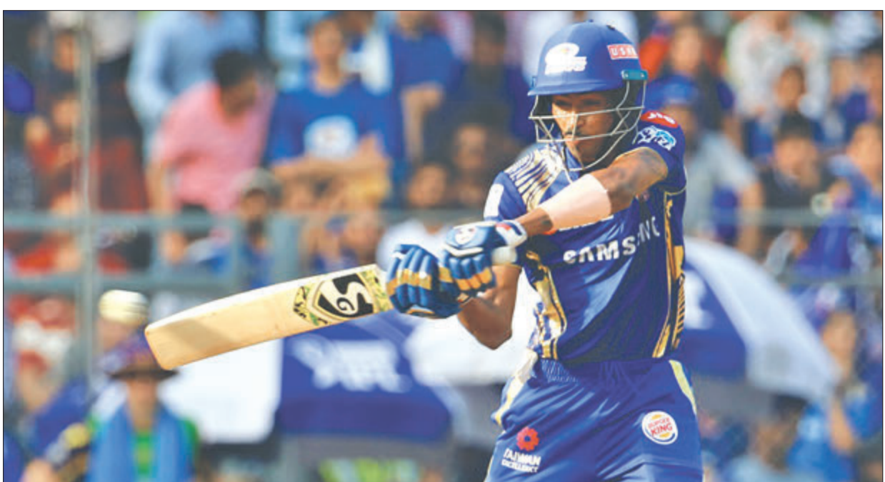
Hardik Pandya of Mumbai Indians plays a stroke against Kolkata Knight Riders during their Indian Premier League match at the Wankhede Stadium in Mumbai on Sunday.

Sousa reaches Estoril final Portugal's Joao Sousa recorded a popular victory on Saturday, beating Greek teenager Stefanos Tsitsipas 6-4, 1-6, 7-6 (7/4) to reach the final of the Estoril Open. He is the first local since Federico Gil in 2010 to make the home final. Sousa will be aiming for his first trophy since winning at Valencia in 2015 as he plays American Frances Tiafoe.