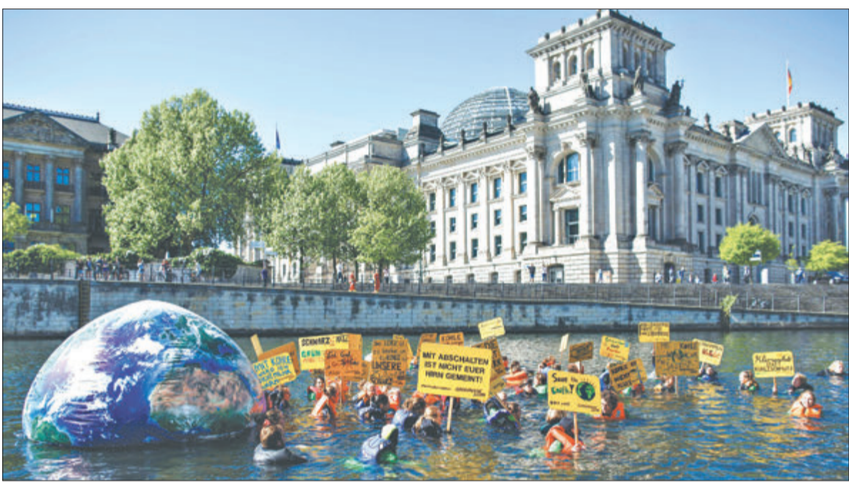
Greenpeace activists hold up posters as they swim with an inflatable globe through the river Spree past the Reichstag building housing the Bundestag (lower house of parliament) in Berlin on Sunday in order to demonstrate for more climate protection.