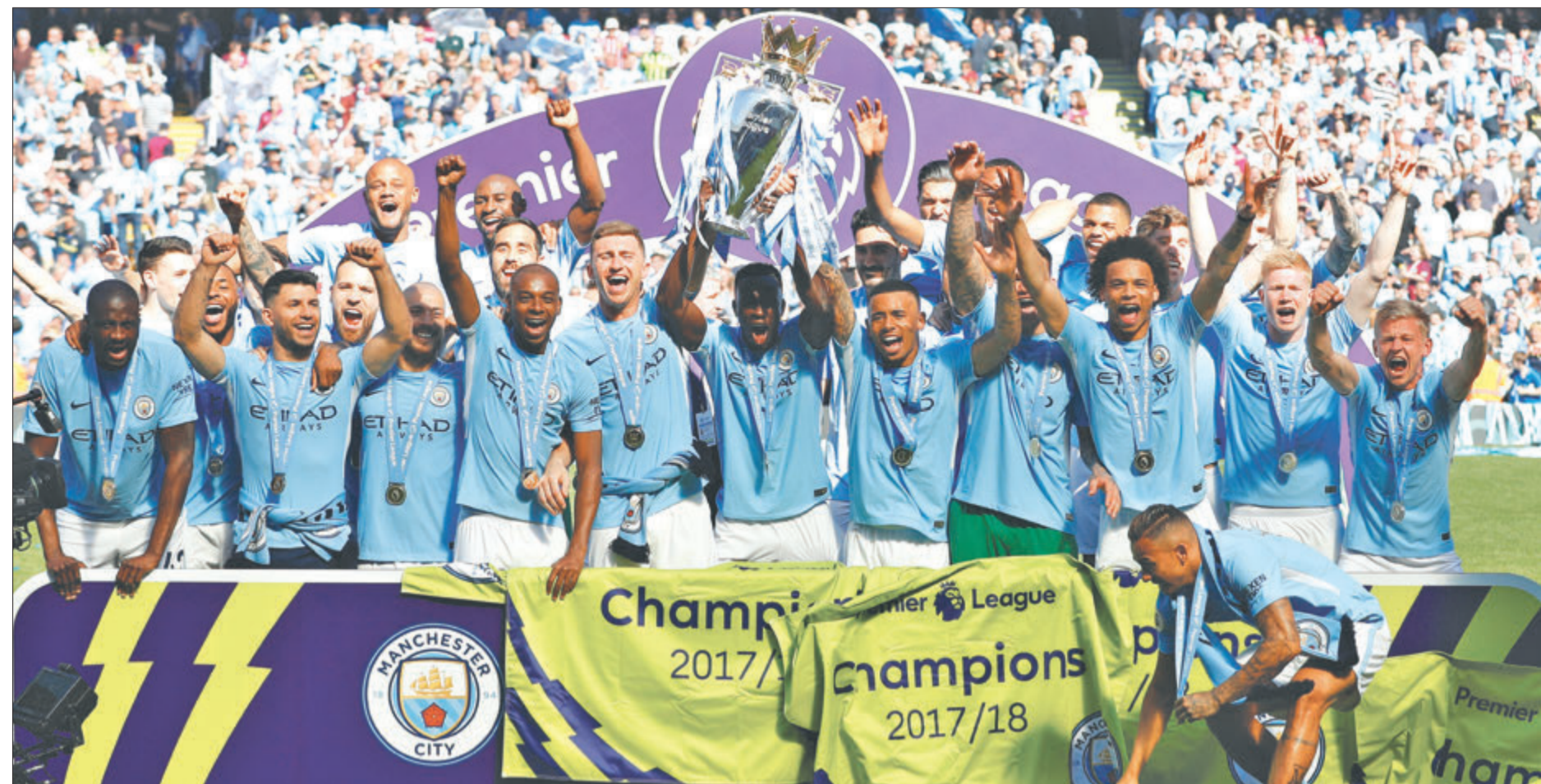
Premier League champions Manchester City celebrate with the trophy after their game against Huddersfield at the Etihad Stadium in Manchester on Sunday.