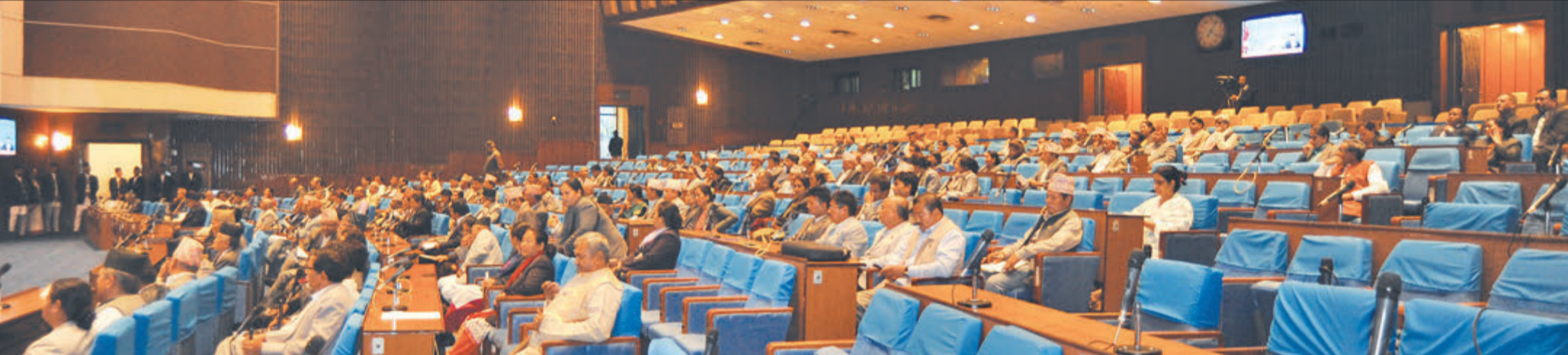
The first meeting of the House of Representatives held at New Baneshwor in Kathmandu as the budget session of Parliament commenced on Sunday.