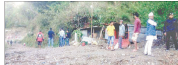
■ Kedarsyu villagers scan the devastation caused by Saturday night's flood.

In Kedarsyu Rural Municipality, flood triggered by heavy rainfall swept away two houses and nine cattle. The villagers said the flood also damaged around 20